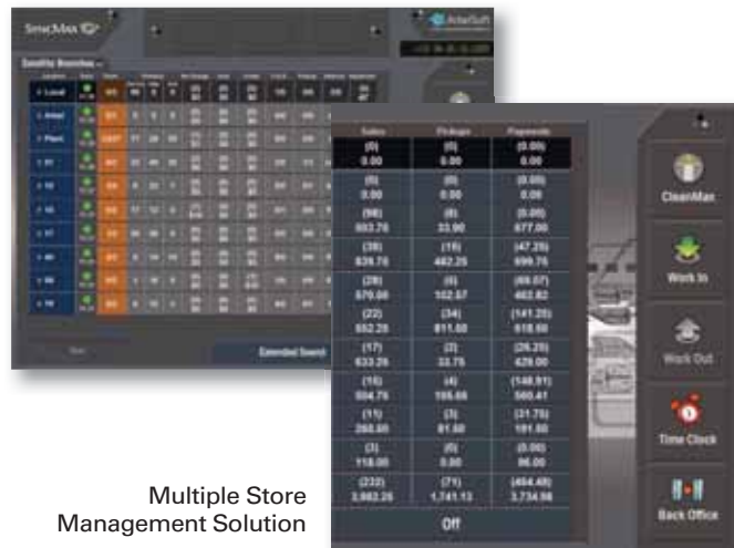
Multiple Store Management Solution

The SyncMax software is ideal for business owners operating large scale businesses with multiple store locations. SyncMax is a two way data transfer and communication system for the remote operation of satellite locations. The system is a perfect complement for LaundroMax and specifically allows for you to track the delivery status at each of your stores in order to prevent garment loss.